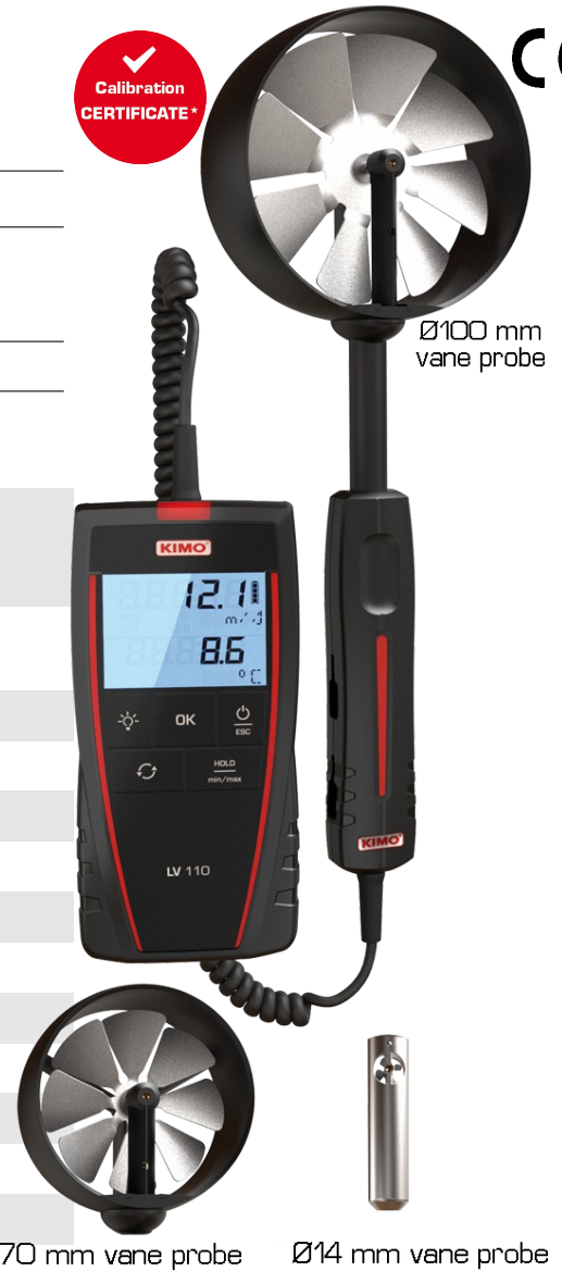
Ø100 mm vane probe